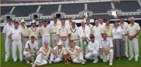
LPCC XI v LPWCC President's (Jade Stadium 16/12/06)

Further to the 125th celebrations, a fixture was held on Lancaster Park, the former home of LPCC, of course these days known as Jade Stadium. Two teams squared off on the main oval with a LPWCC President's team taking on a LPCC XI.